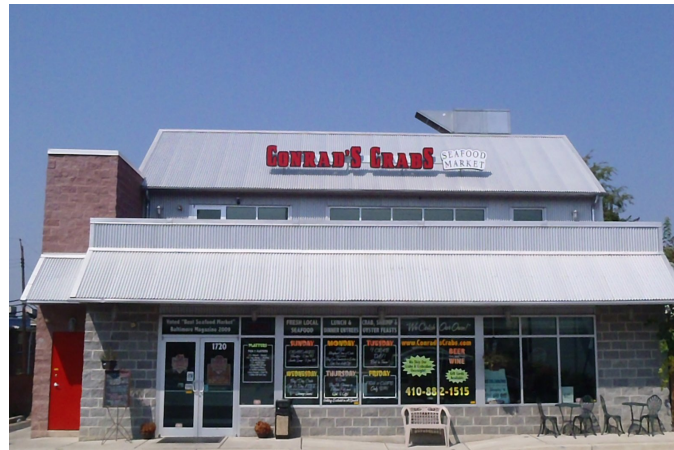
Conrad's Crabs & Seafood Market